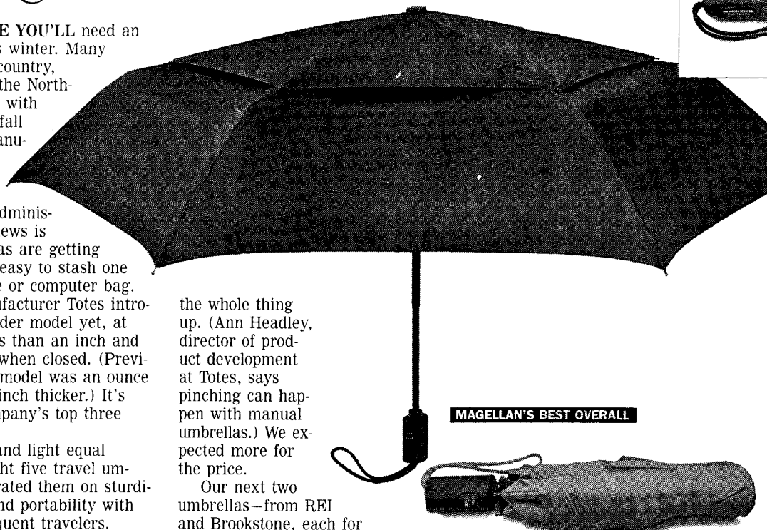
MAGELLAN'S BEST OVERALL

At last, the WindPro umbrella, for $25 at Magellan's, came in with the right balance of features and size. It wasn't our smallest, at 11 inches when closed, but its unusual flat-frame construction—it folds into a thin rectangle—made it easy to slide into our bag. It also felt the sturdiest of all, without being too heavy. The black center rod was made of hefty steel, unlike most of our others, which used a more lightweight aluminum. Its fabric extended to a 43-inch-wide arc, far enough to keep our knees dry, plus it came with